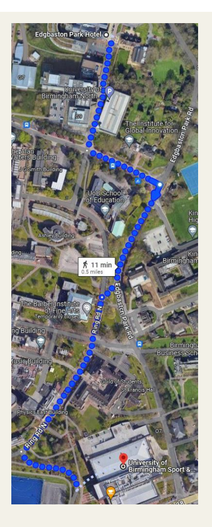
Edgbaston Park Hotel: 0.5 Miles – 11 minute walk