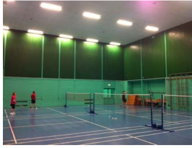
£22,500 towards new Lighting at Chilwell Olympia School, home of Nottinghamshire Badminton Association and Chilwell Olympia PC for the next 28 years.