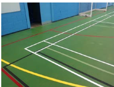
The Potteries Performance Centre has secured access to Newcastle Under Lyme School's 4 court hall for 15 years in return for £220,000 towards the refurbishment of the sports complex.