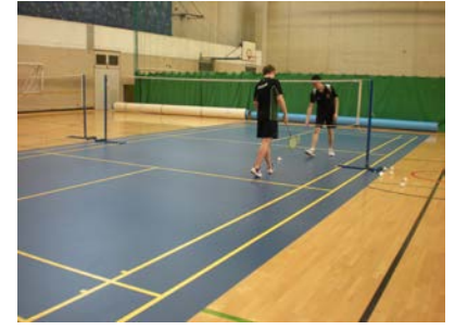
£29,000 to buy five badminton court mats and fit blinds on sports hall windows for Exeter University, in return for a 7 year access agreement