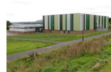
Tyneside Badminton Centre was awarded £345,000 towards the expansion of the Slatyford Centre from 3 courts to 8, following an asset transfer from Newcastle City Council.