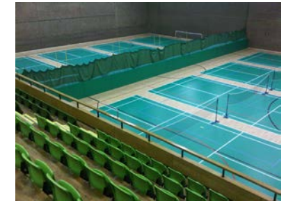
Thornaby Pavilion has a new floor and spectator seating in its 8 court hall thanks to a grant of £48,000. In return Teesside PC will have access for training and tournaments for 10 years.