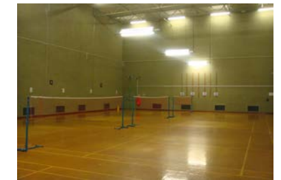
Babington College has been granted £198,000 towards the refurbishment of 8 courts in return for a 26 year licence to Leicestershire Badminton Association and the Leicester PC.