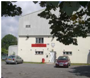
Hounslow Badminton Association received £127,000 towards a teaching room, fitness room and treatment room at The Dome Badminton Centre, on which they have a 25 year lease.