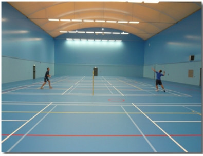
£150,000 invested in a new 7 court hall at Portchester School, Dorset, in return for a 15 year access agreement.