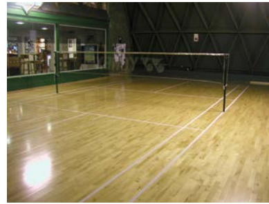
£46,500 invested in a new floor and heating at Wimbledon Racquets and Fitness Club to secure a home for the Wimbledon PC for the next 10 years.