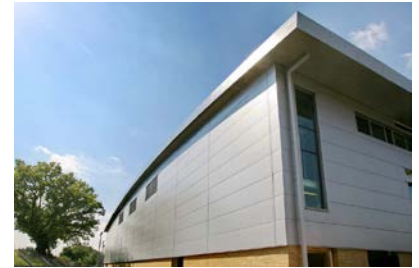
Redbridge Sports Centre received £300,000 towards a new 12 court hall to be used as an Olympics training venue and afterwards as home to Redbridge PC for 15 years.