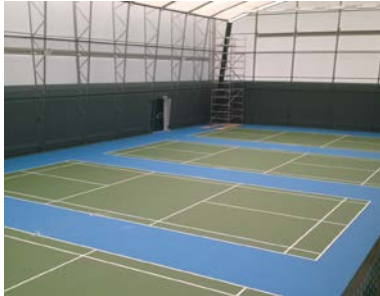
A new 8 court hall at William Edwards School, Essex. £330,000 invested in return for 30 years of exclusive use outside school hours.