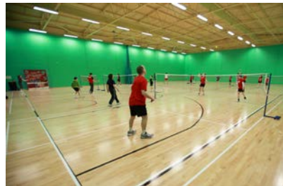
£250,000 has been invested in the refurbishment of Broadway Sports Centre, St Helens, to provide a home for Merseyside PC for the next 15 years.