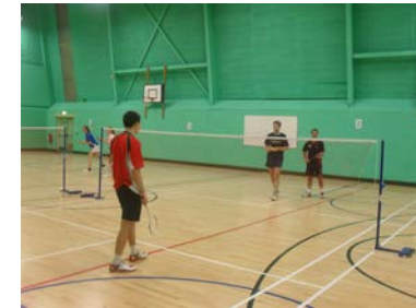
St. Peter's School, Solihull was awarded just under £100,000 towards the enhancement of their 4 court hall as a home for Solihull and Shirley PC for the next 10 years.