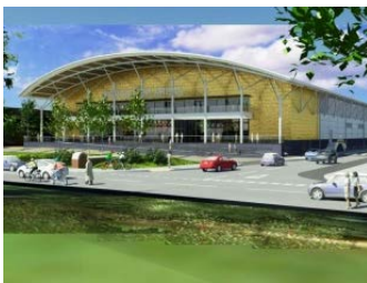
Worcester University received £200,000 towards the construction of a new multi-sport arena offering up to 12 courts to Worcester PC for 20 years.